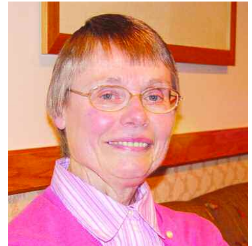
The Carol Rohrer Breast Cancer Endowment Fund helps support programs for women cancer survivors.