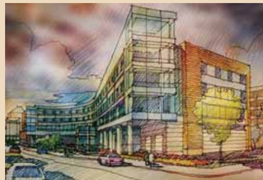
Here's an architectural rendering of what St. Joseph's Hospital could look like.

Building on its Catholic identity, St. Joseph's Spiritual Care has supported a variety of religions, cultures and faith traditions. The caring presence and gentle touch of chaplains embody the values of its founding Sisters of Saint Joseph of Carondelet.