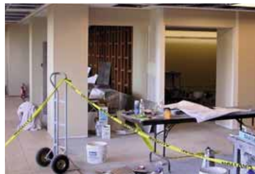
A look at Bethesda's chapel, mid-construction.

While the chapel is closed, prayers for healing continue to be broadcast on the in-house cable channel.