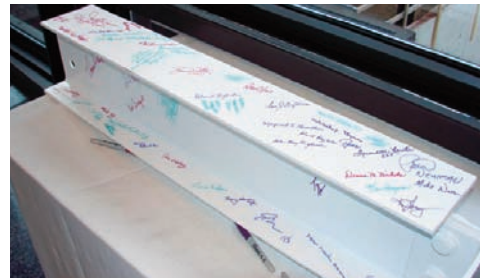
This was the last beam to be placed inside the patient tower. It was signed by employees, physicians, volunteers, donors, Sisters of St. Joseph of Carondelet, grateful patients and families, and other individuals.