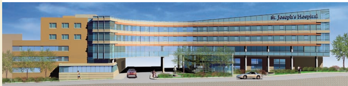
The new patient tower at St. Joseph's Hospital.